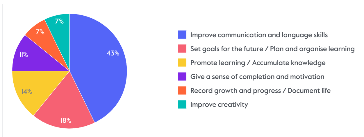
Figure 3: The importance of reflecting

International students can improve their writing and logical thinking skills through the process of posting blogs. (Diana)